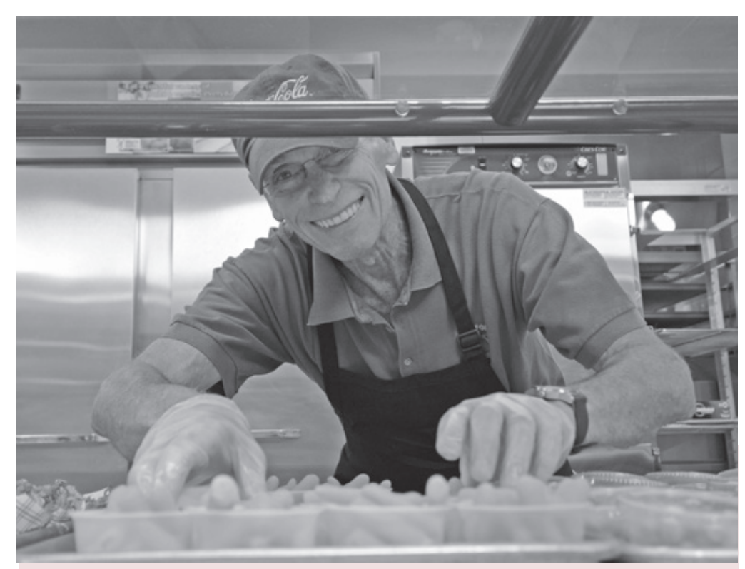
A member of the Food Services Department serving carrots at Calkins Road Middle School. Check out the gourmet salads and made-to-order wraps that are available every day.

A publication for the residents of Pittsford Central School District